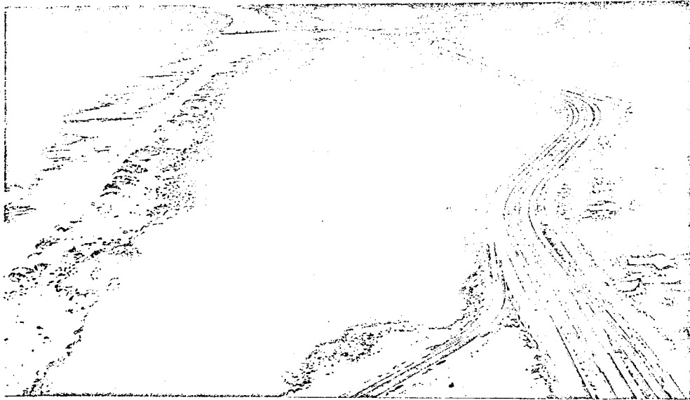
Fig. 1. An aerial view of the Beachwood Mangroves, Durban looking south. (1967)