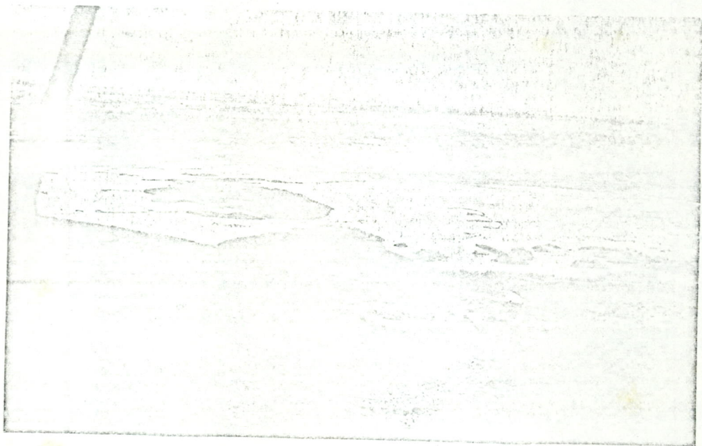
Fig. 3. An aerial view of the Kosi Bay Mangroves looking west. (1967)