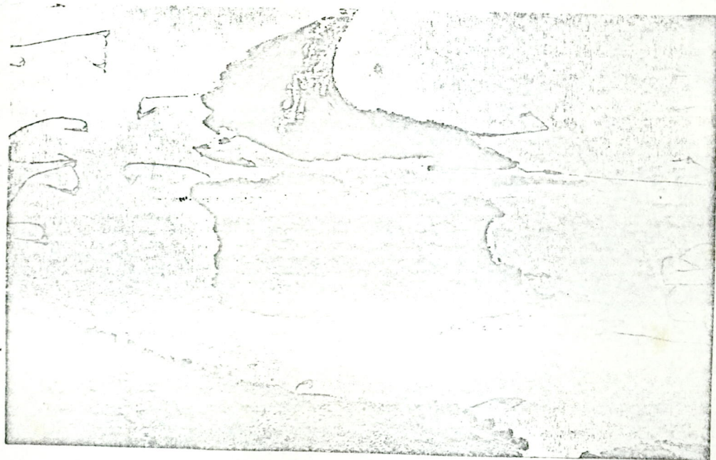
Fig. 4. A closer aerial view of Mangroves at Kosi Bay. Note cutting of Mangroves to provide material for "fish kraals" or traps. (1967)